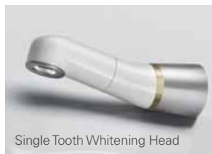
Single Tooth Whitening Head

A full charge will deliver 400 cycles of 3-second cures or 100 cycles of 10-second cures. Free from the memory effect, charging the battery with a partial charge will not affect the life of the battery.